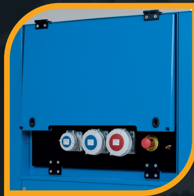
Instrument protection door