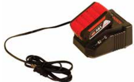
Battery and charger included with purchase of KBUG-1200-BAT or KBUG-1202-BAT

The K-BUG 1200 and the NEW K-BUG 1200-BAT are compact, portable, straight-line tractors equipped with rugged gear drives and an improved torch adjustment profile. The Gear Drive has been incorporated to handle the strain of prolonged operation and to improve reliability. Creating continuous or intermittent “stitch” welds at a constant travel speed produces high quality, uniform welds in a fraction of the time required for manual welding. Regulated travel speed eliminates excessive weld deposition and helps reduce defects. Precise puddle control improves penetration and controls undercut.