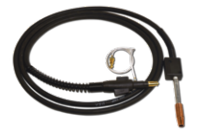
KBUG-1067 Magwheel Add-On Kit Used for welding curved irregular shapes

(B)- Cable Length 15 ft (4.57 m) / 25 ft (7.62 m)