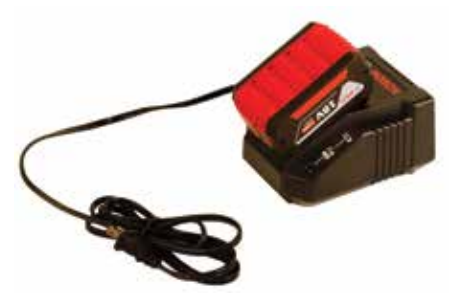
Battery and charger included with purchase of KBUG-1200-BAT or KBUG-1202-BAT

The K-BUG 1200 and the NEW K-BUG 1200-BAT are compact, portable, straight-line tractors equipped with rugged gear drives and an improved torch adjustment profile. The Gear Drive has been incorporated to handle the strain of prolonged operation and to improve reliability. Creating continuous or intermittent "stitch" welds at a constant travel speed produces high quality, uniform welds in a fraction of the time required for manual welding. Regulated travel speed eliminates excessive weld deposition and helps reduce defects. Precise puddle control improves penetration and controls undercut.